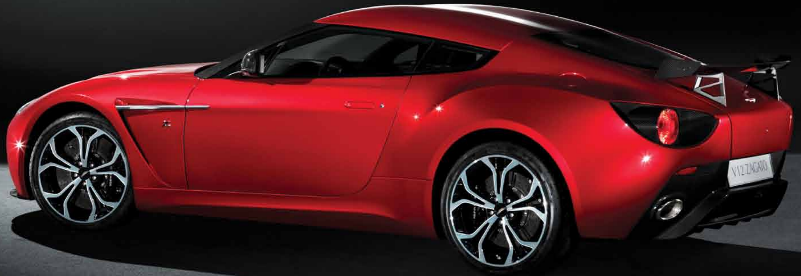
Aston Martin V12 Zagato fitted with wheels manufactured by Rimstock

The Team Dynamics range of alloy wheels are manufactured in the UK in exactly the same way, using the same plant, equipment and personnel so you can be sure that Team Dynamics alloy wheels are manufactured to the highest possible standards.