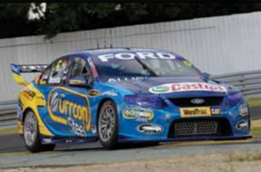
V8 SUPERCARS: FORD FALCON FG