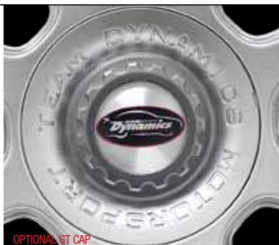
OPTIONAL GT CAP