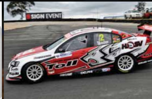
V8 SUPERCARS: TOLL HOLDEN RACING TEAM