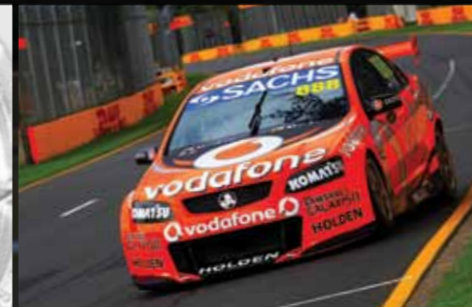
V8 SUPERCARS: TEAM VODAFONE