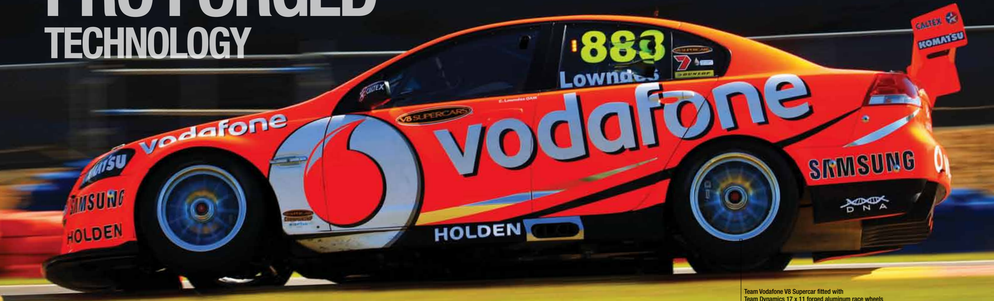
Team Vodafone V8 Supercar fitted with Team Dynamics 17 x 11 forged aluminum race wheels

Available 16 through to 22 inches in a comprehensive range of rim widths and offsets.