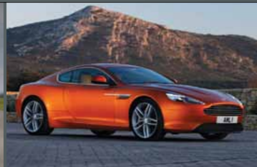
ASTON MARTIN VANTAGE