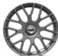
MATT GRAPHITE / GT CAP