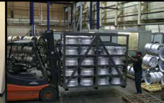
IN HOUSE HEAT TREATMENT