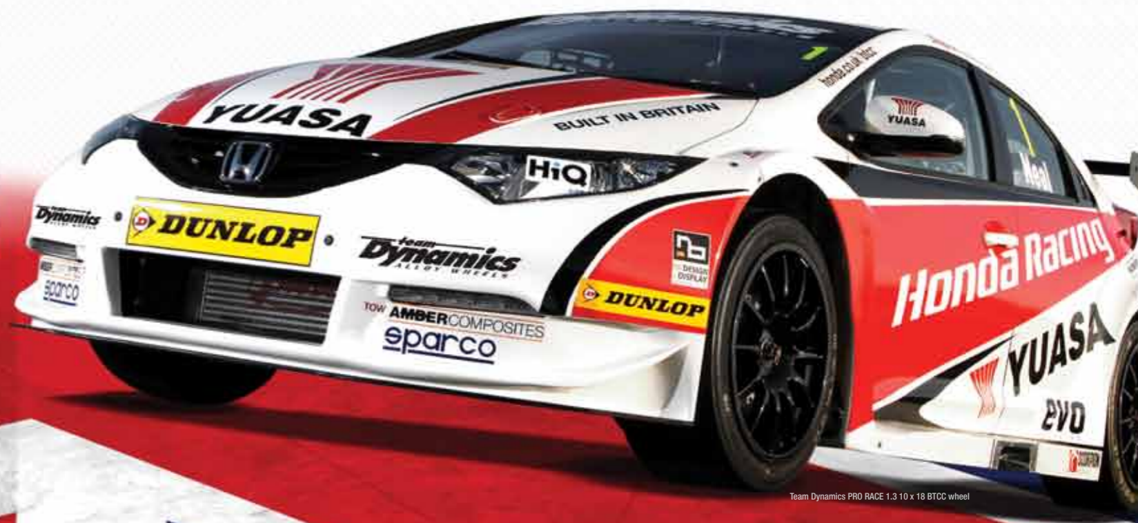
Team Dynamics PRO RACE 1.3 10 x 18 BTCC wheel