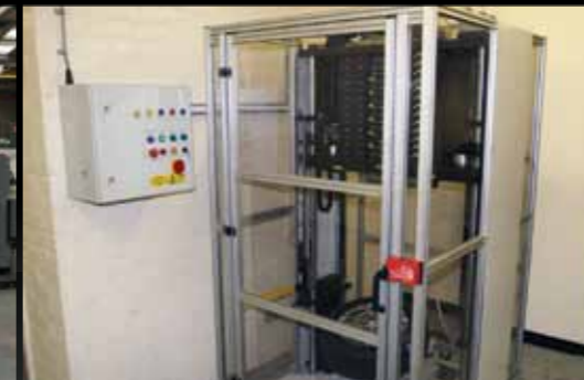
WHEEL TEST FACILITY