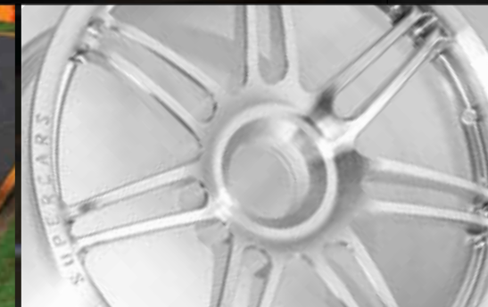
V8 SUPERCARS WHEEL