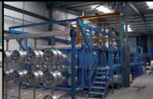
11 STAGE PRE TREATMENT