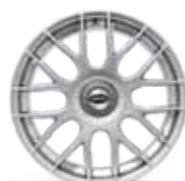
HI-POWER SILVER / GT CAP