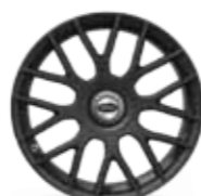
MATT BLACK / GT CAP