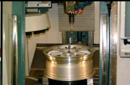
DIGITAL MACHINE SHOP