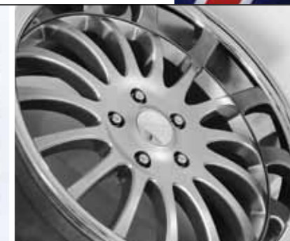
*ENGRAVING ON 17" AND 18" WHEELS ONLY