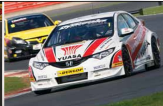
BRITISH TOURING CAR