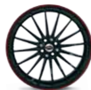
GLOSS BLACK / RED LINE