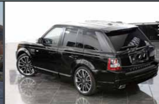
OVERFINCH RANGE ROVER SPORT