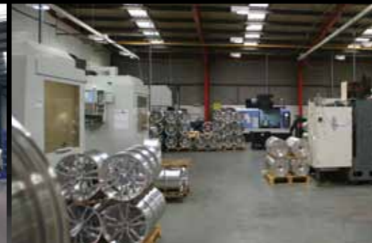
HI TECH FORGED UNIT