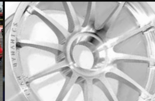
V8 SUPERCARS WHEEL