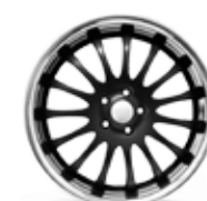
BLACK / STAINLESS STEEL RIM