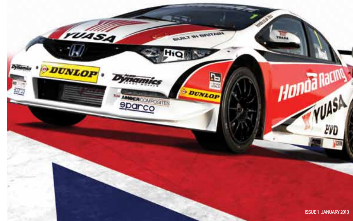
ISSUE 1 JANUARY 2013