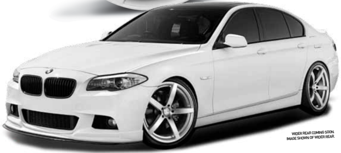
WIDER REAR COMING SOON. IMAGE SHOWN OF WIDER REAR.