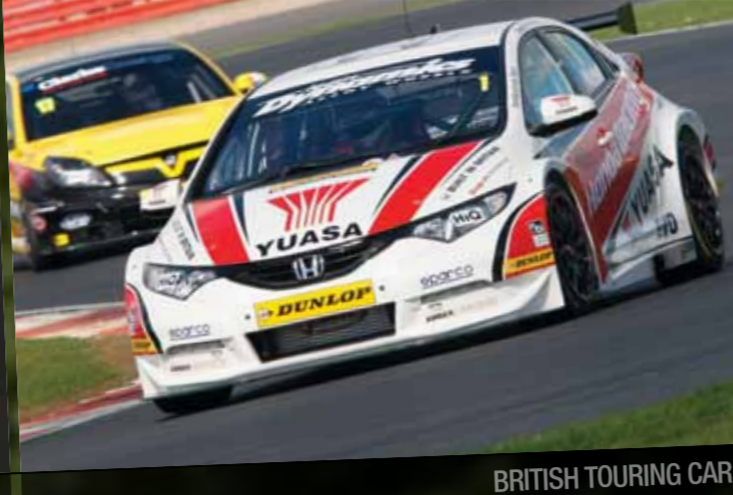
BRITISH TOURING CAR