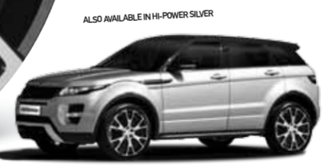
ALSO AVAILABLE IN H-POWER SILVER