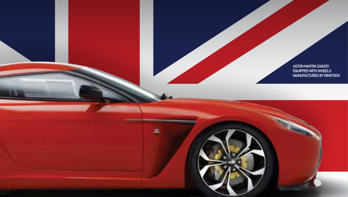
ASTON MARTIN ZAGATO EQUIPPED WITH WHEELS MANUFACTURED BY RIMSTOCK